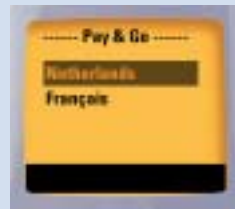
1. Language selection

The multilingual functionality comprises the whole menu structure and the card applications.